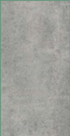
VINTAGE STONE GRÅ 3D*