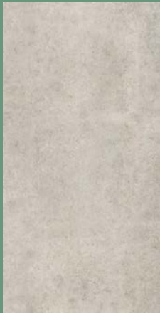
VINTAGE STONE BEIGE 3D*