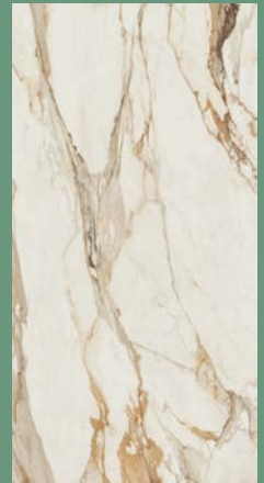
CALACATTA OLD SOFT & GLOSS