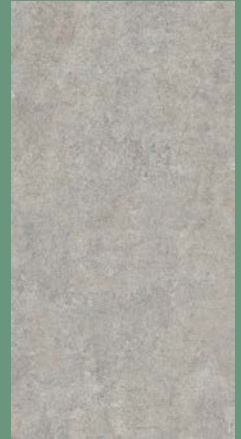
ROLLING STONE BEIGE 3D*