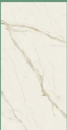
CALACATTA ORO 3D* SOFT & GLOSS