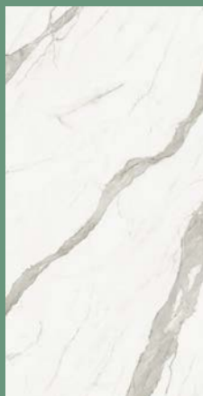
STATUARIO 3D* SOFT & GLOSS