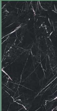
NERO MARQUIÑA SOFT & GLOSS