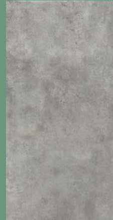
ROLLING STONE GRÅ 3D*