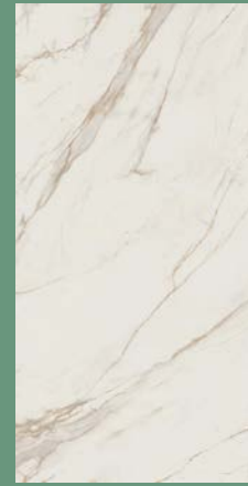
CALACATTA GOLD SOFT & GLOSS